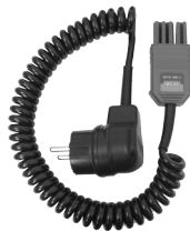
WS-05 adapter with UNI-SCHUKO angular plug WAADAWS05