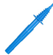
test probe with banana socket; 1 kV; blue WASONBU0GB1