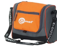
M-6 carrying case WAFUTM6