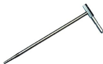
earth contact test probe (rod) 26 cm WASONG26