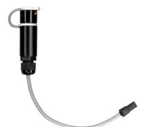
LKO-720 C-3/C-8 adapter WAADALKOC8