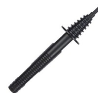
pin probe, black 11 kV (banana socket) WASONBLOGB11