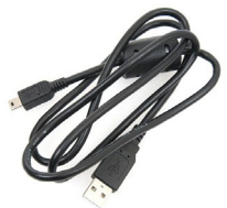
mini-USB cable WAPRZUSBMNIB5