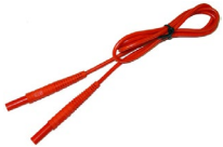
test lead with banana plugs; 1 kV; 1.2 m; red WAPRZ1X2REBB