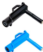
Magnetic voltage adapter black / blue WAADAUMAGKBL WAADAUMAGKBU