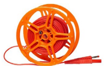
test lead with banana plugs on reel; 1 kV; 20 m; red WAPRZ020REBBSZ