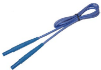
test lead with banana plugs; 1 kV; 1.2 m; blue WAPRZ1X2BUBB