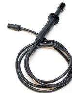
non-contact probe WASONBDOT