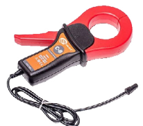
C-8 clamp probe WASONCEG8