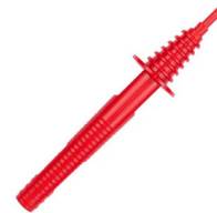
test probe with banana socket; 1 kV; red WASONRE0GB1