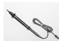
contact probe WASONDOT